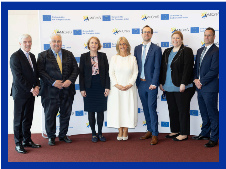
Frankfurt School and IOB Team

MiCreS, funded under the Erasmus+ Forward Looking Programme, sets out to establish Europe's first blockchain-based ecosystem for micro-credentials in financial services.