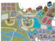
Greenfalls, Group 1