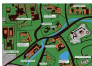
Tribustown, Group 2