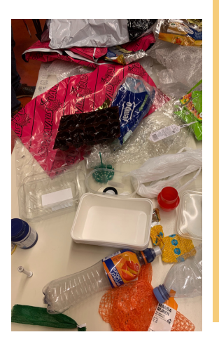
8 partners from: EL \cdot IT \cdot MT \cdot NL \cdot RO